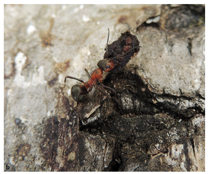
5. (a) Formica ants scavenging on a dead blowfly (Calliphoridae) and (b) a Formica ant carrying a piece of wild boar carcass.