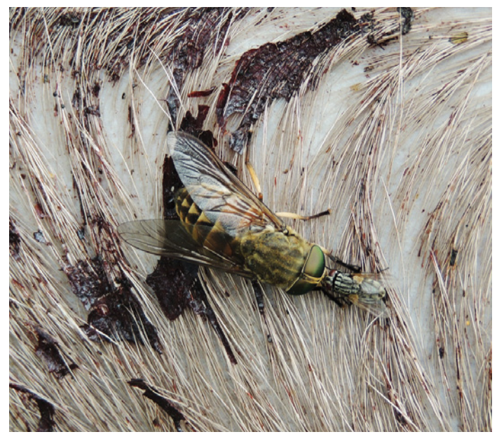
7. Tabanus sudeticus on a red deer carcass. 7. Tabanus sudeticus op een edelhertkadaver.