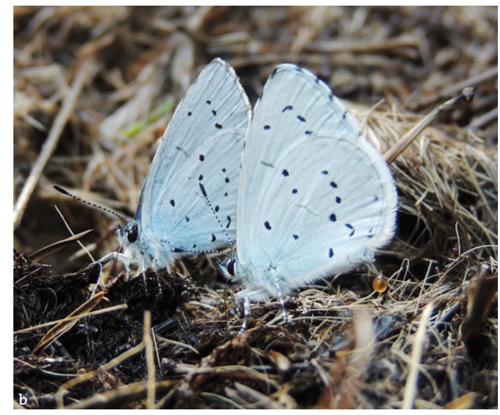
4. (a) Araschnia levana and (b) Celastrina argiolus sucking on carcass.