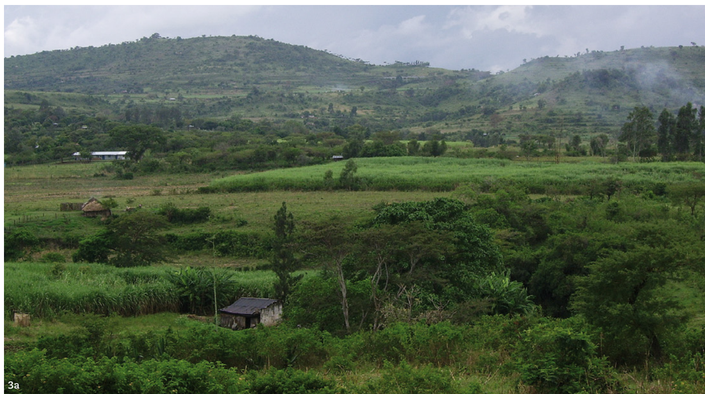
3. Pictures of the study sites in western Kenya: highland villages of Fort Ternan (a) and Lunyerere (b), and a rice paddy near the peri-urban village Nyalenda (c).

3. Impressie van de onderzoeksgebieden in west Kenia: de op een hoogvlakte gelegen dorpen Fort Ternan (a) en Lunyerere (b), en een rijstveld buiten het nabij de stad Kisumu liggende dorp Nyalenda (c).