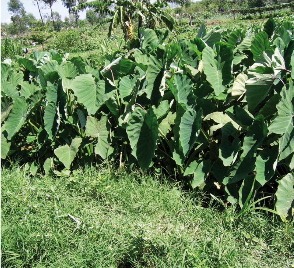
5. Arrow root ( Maranta arundinacea ) plants grown along water canal. 5. Arrowrootplanten langs een kanaal.

(drainage of stagnant water) would be useful for mosquito control; however, it was not clear how many practiced it (Imbahale et al. 2010). The control of aquatic stages of mosquitoes can be incorporated into the current integrated malaria control programmes that mainly target adult mosquitoes and treatment of malaria parasites. Although spatially limited, this study provides evidence-based combinations of mosquito larval control strategies which can be explored on a large scale.