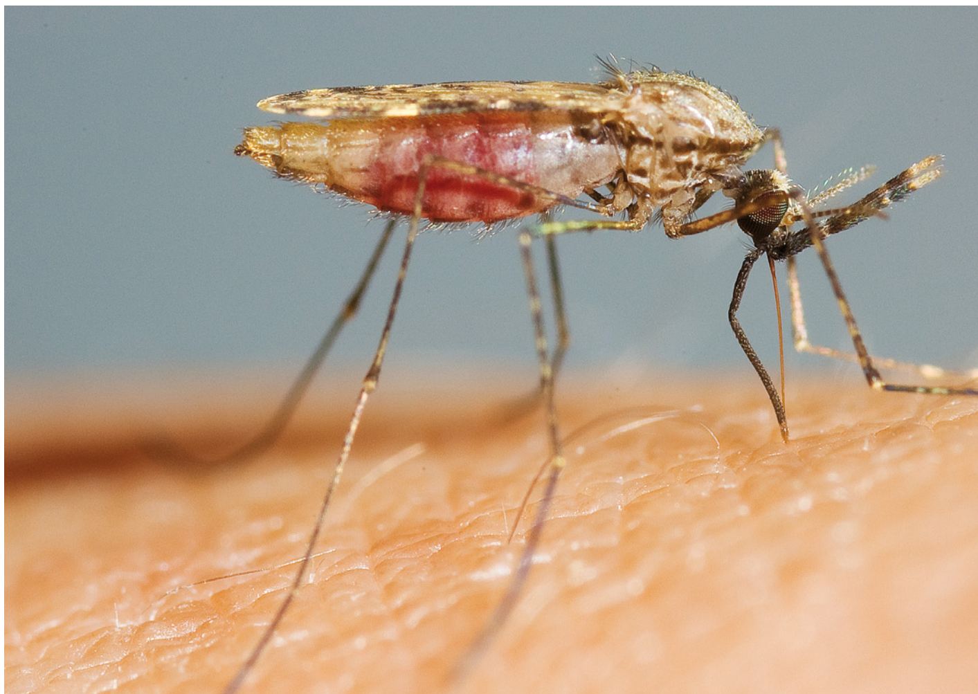
1. Adult Anopheles gambiae female sucking blood on human skin.

1. Zich voedend volwassen Anopheles gambiae wijfje.