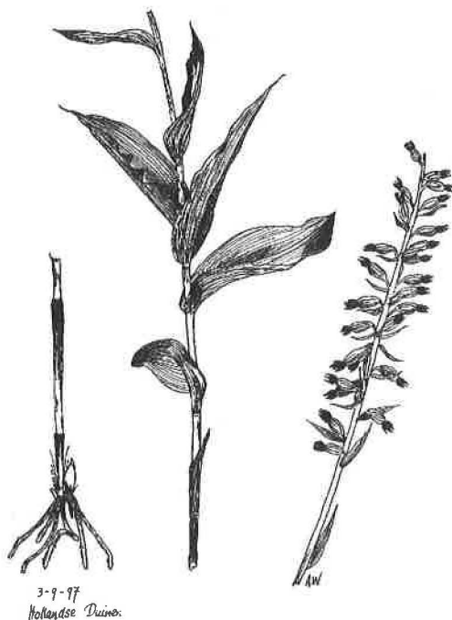
Epipactis helleborine ssp. neerlandica .

Autogamy only takes place incidentally in Epipactis helleborine ssp. neerlandica , but our observations show that even a plant, well adapted to extreme conditions, can change its mode of pollination if required. Here we have an example of a taxon that moves over towards autogamy, but there are also reports of cases where exactly the