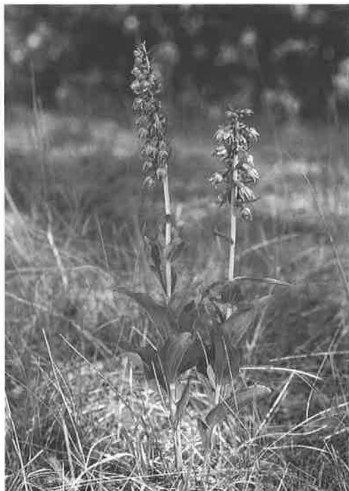
Epipactis helleborine ssp. neerlandica in the salix repens -scrub in the Waterleiding dunes.

We tend to regard all taxa as subspecies of Epipactis helleborine , because they are quite distinct in the center of their area of distribution, but there can be found transitional stages towards the nominate species.