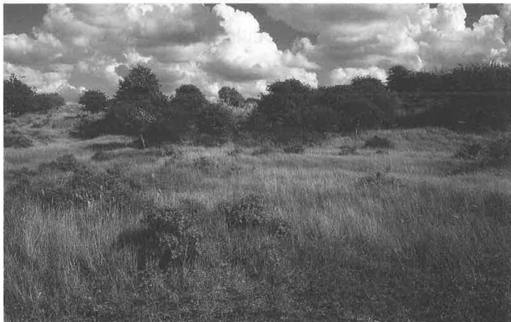
Salix repens -scrub in the dunes of Holland.

cies are Epipactis lusitanica Tyteca and E. distans Arvet-Touvet. The latter species is only recently brought down to the rank of subspecies; its name then is E. helleborine ssp. orbicularis (Klein 1997).