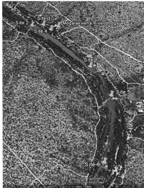
Fig. 1. The study area showing the Mogalakwena river and the matrix of dry savanna.

Virtually all individuals were males, but both female and male individuals of O. chrysostigma , C. erythraea and T. kirbyi were at certain sites, and engaged in courtship. T. kirbyi , T. furva , O. chrysostigma and C. erythraea males were highly territorial among themselves and with each other.